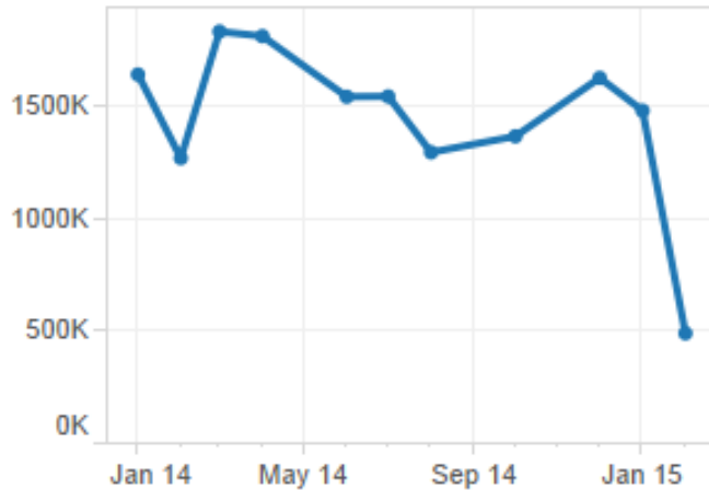
gaps hidden (bad)